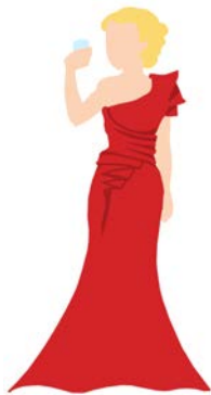
Rose den Waldern Queen