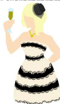
Gwen Kreig Rising Star